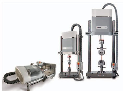
The Instron ElectroPuls family

Instron has engineered the BioPuls range to be the most advanced solution for biomedical testing challenges. With demands as diverse as low force testing on native tissues to complex multi-axial simulation of spinal segments , we have ensured that our products best fit the needs of individual customers and provide many years of superior performance. With no compromises on quality or performance, the