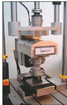
Multi axial spine testing system