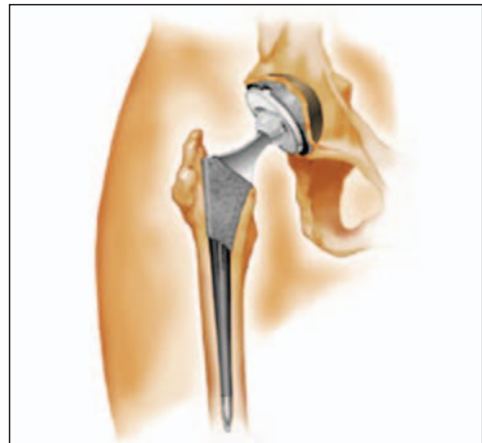
Figure 2. The schematic drawing of a replaced hip